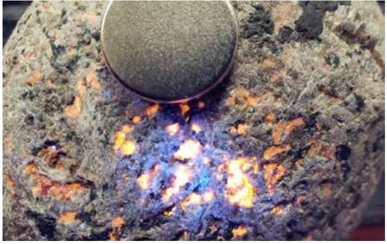
Fairly bright UV response even in normal household lights!The Rockfinder October 2019Page 4 of 5