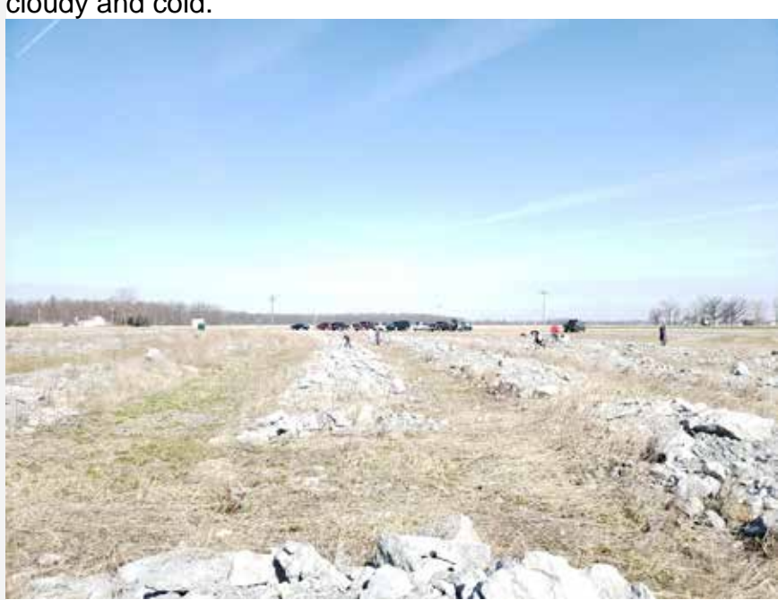
Continued next page

On Saturday April 6, 2019 a few (three to be exact) club members made the drive to the Paulding County Community Fossil Park. It turned out to be a beautiful sunny day, even though it started out cloudy and cold.