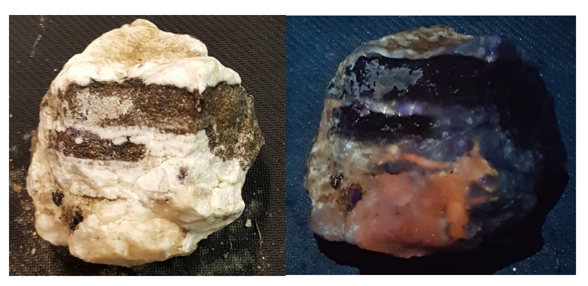
The Rockfinder October 2018 Page 7 of 8

We soon had our UV lights out as the sun dipped below the horizon and the ground took on a totally different perspective. Most people just wandered around search while a few dug. I took a different route and went to the edges of the tailings and looked under the leaves of low hanging branches. My hunch paid off as I found the most specimens that night. Most of the minerals we found that fluoresced were either fluorite or calcite. There was smattering of other minerals, but I am just learning and have yet to identify all my finds. This was day 1 of the weekend trip. Day 2 will be in a latter issue, so stay tuned.