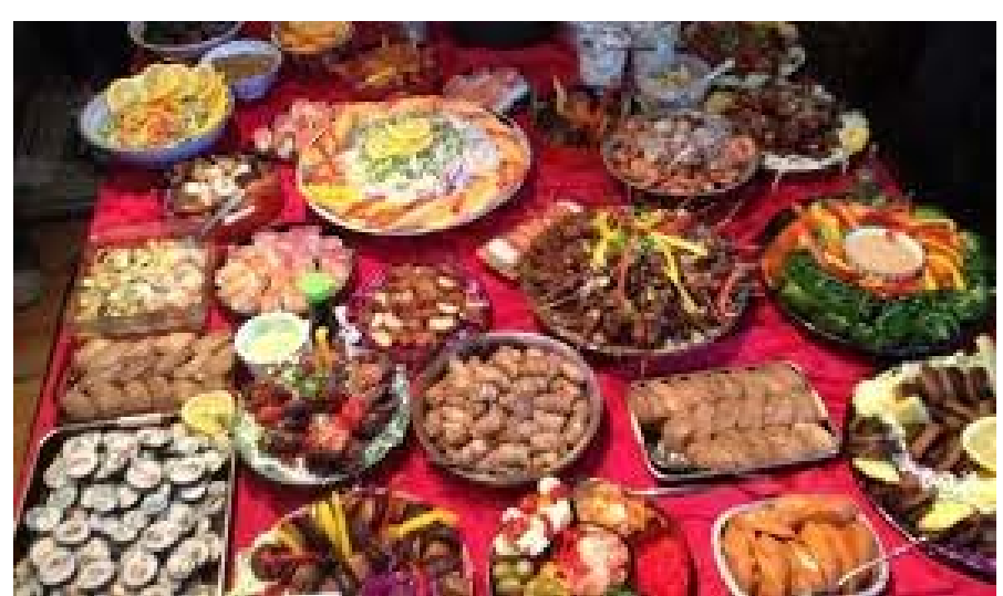
The Rockfinder October 2018 Page 3 of 8

We still need volunteers for October, but we ask <u>all who sign up</u> to help set up, serve, and clean up after. This eliminates anyone having to arrive so early and stay quite late after the meeting is over.