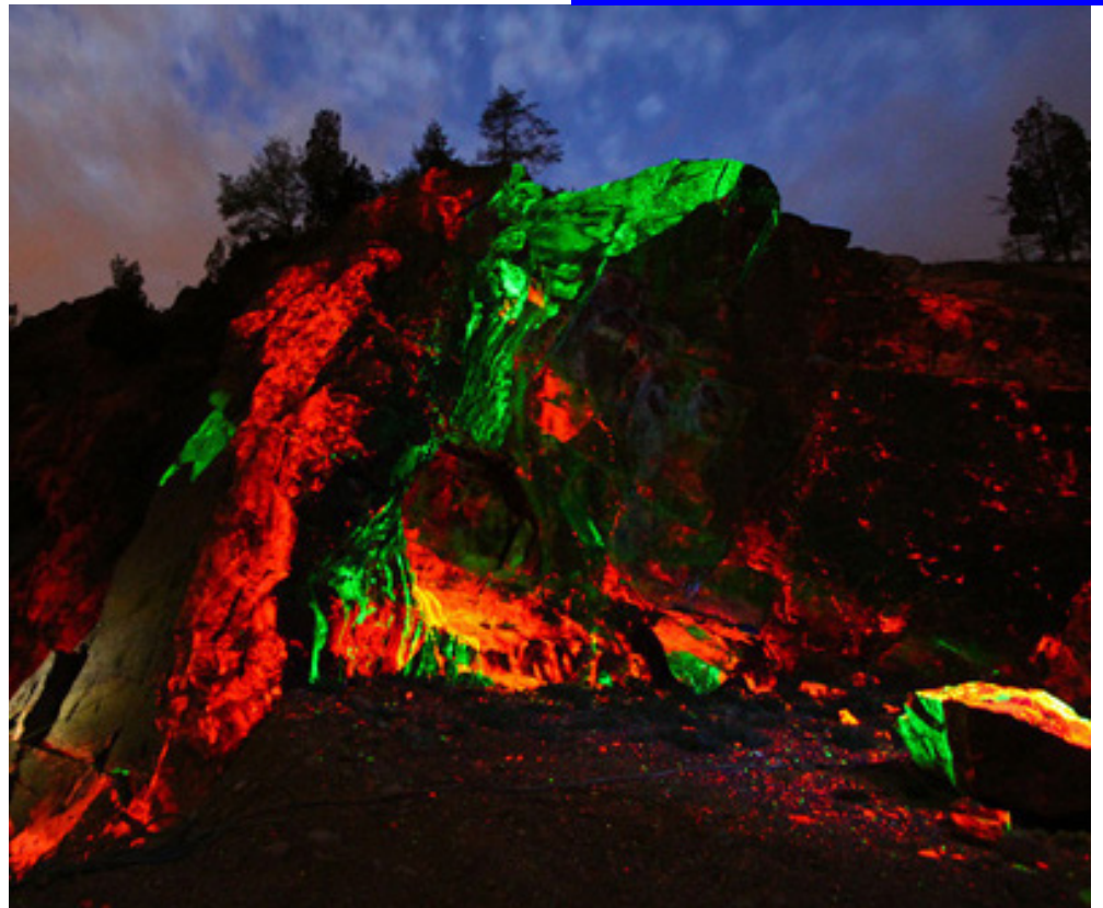
Photo of the "glowing wall". Copyright Sterling Hill Mining Museum. Excerpted from the internet 04/04/18. Visit their website HERE.