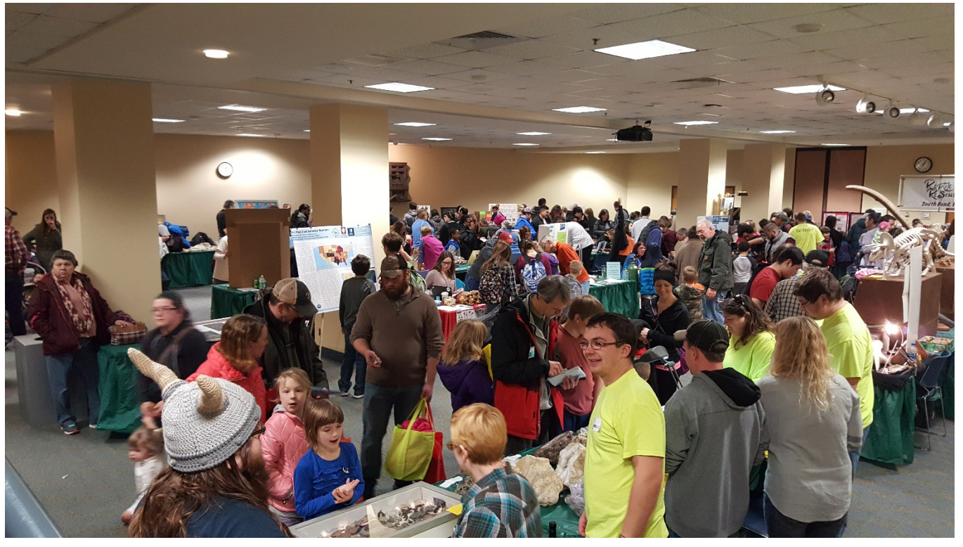
Crowds throughout the day kept our members busy.