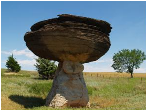
Time to hunt mushrooms! Website Credit